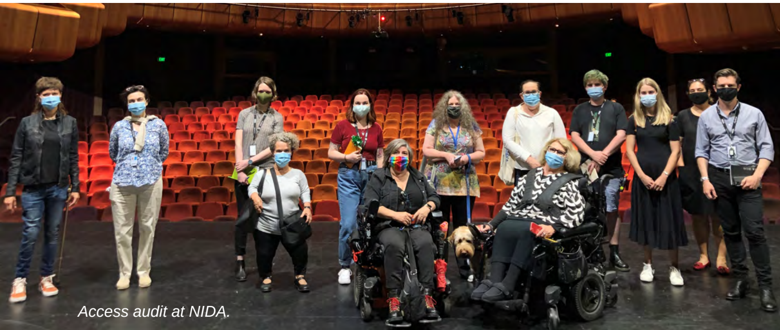
Access audit at NIDA.

We delivered 32 arts and disability online training sessions across two workshop streams, including a newly developed Delivering Accessible Online Events workshop which was created in response to the industry's shift to online activities due to COVID-19. 650 participants attended our workshops in 2020 from a range of organisations. We also commenced development of online learning modules for our Disability