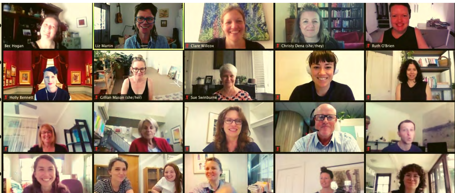
Disability Confidence Training online workshop.

We also secured a range of COVID-19 related grants from Create NSW, the City of Sydney and the National Disability