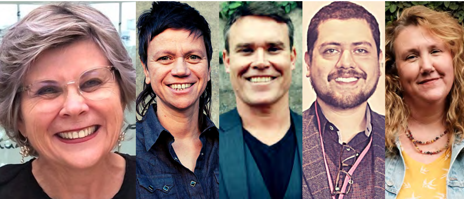
Accessible Arts management team.