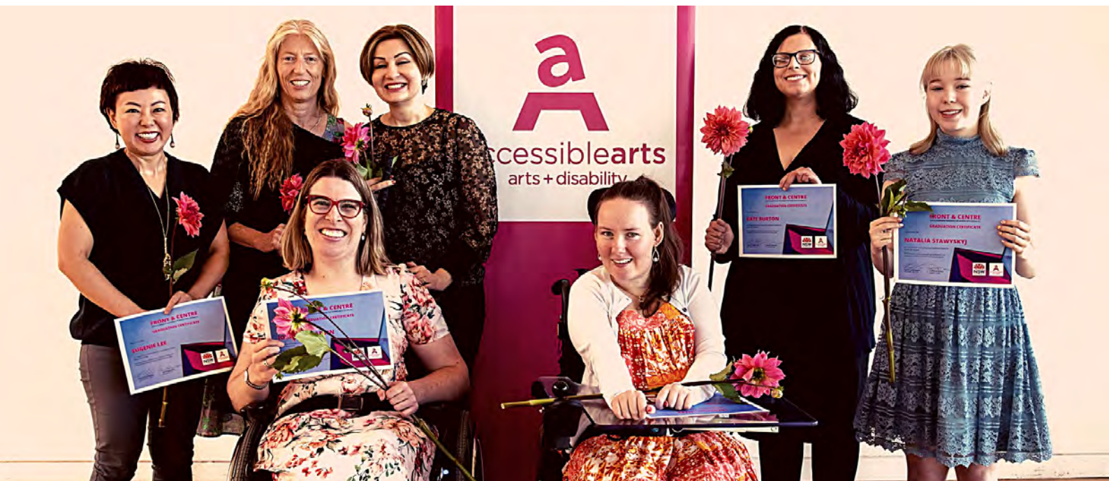
Front & Centre Arts Leadership Program graduates.

We acknowledge the traditional owners of the land on which we work across NSW and pay our respects to Elders past, present and emerging.