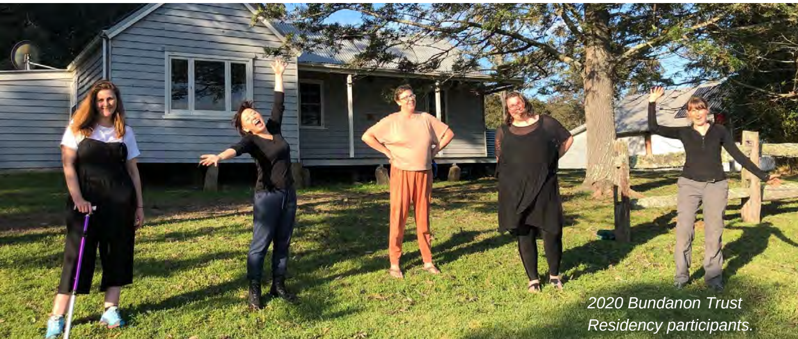
2020 Bundanon Trust Residency participants.

In partnership with Bell Shakespeare we supported the development of a new show exploring neurodiversity through Shakespearean characters. 10 women