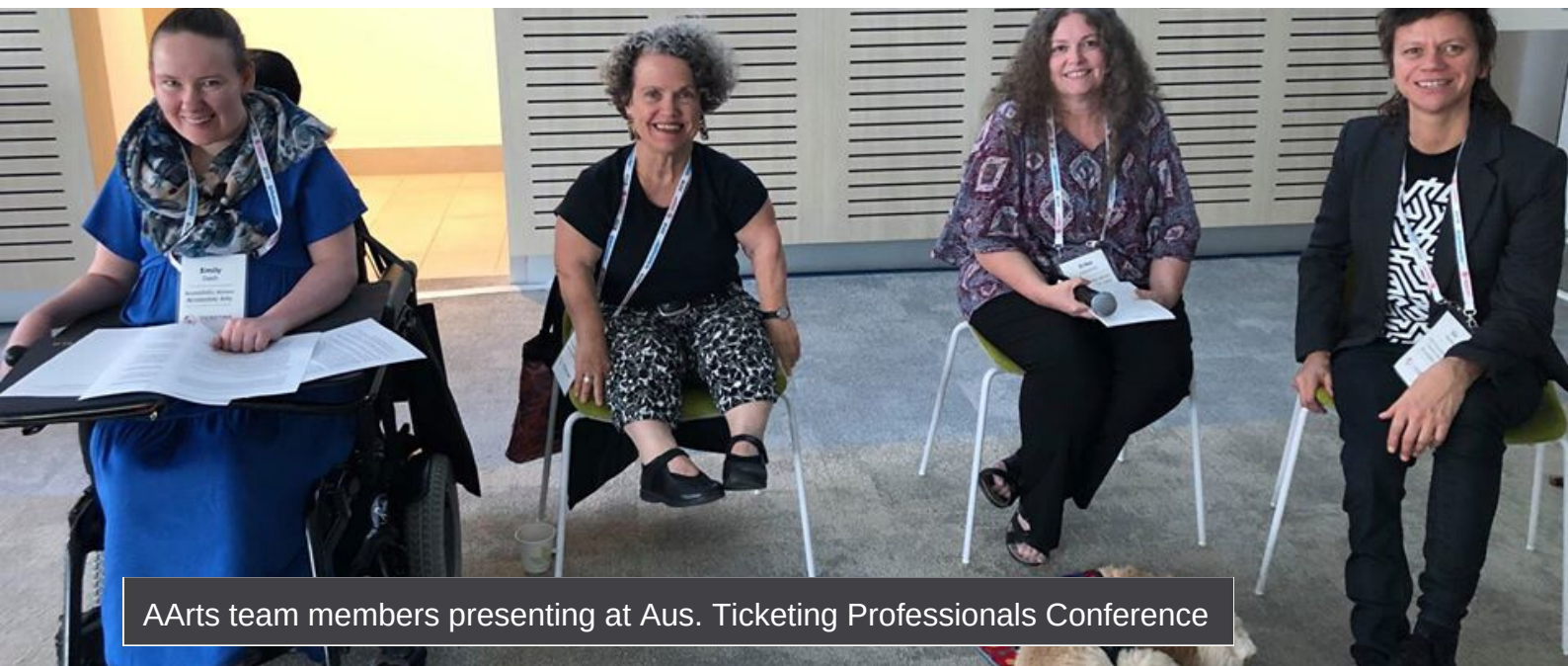
AAarts team members presenting at Aus. Ticketing Professionals Conference

A highlight of this work involved evaluating the Eastern Riverina Arts