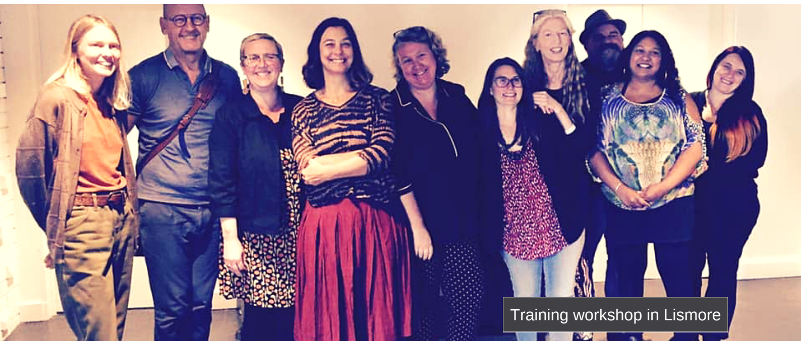
Training workshop in Lismore

"Keep prioritising disability led practice, leadership and collaboration. Along with disability-led, make space for integrated initiatives as well, and the nurturing of informed connected allies."