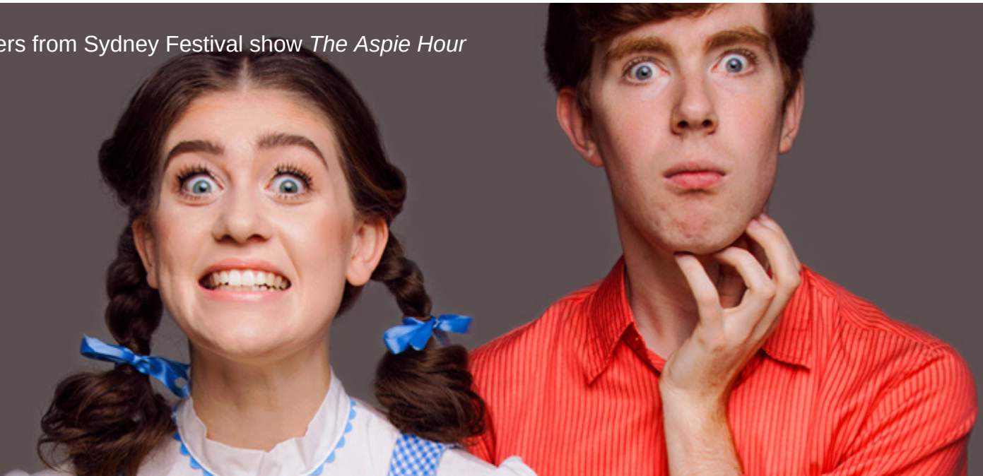
Performers from Sydney Festival show The Aspie Hour

forum for building connections and collaboration among artists with disability. In addition, our team delivered assistance and advice to individuals and groups with funding applications as well as identifying opportunities for showcasing their work.